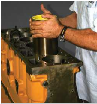
Con Rod Kits

Reduce your machines' down time by using CTP CON ROD Kits